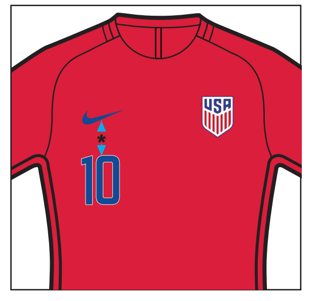
Front Number * On all kits:- Centrally - 1.6in under Nike Swoosh

Note: This positioning information is intended as a guide only for adult, youth and infant kits. Spacing may need to be reviewed in individual circumstances for the best fit to be achieved.